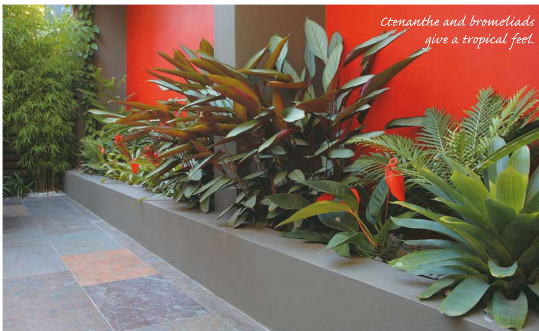
Ctenanthe and bromeliads give a tropical feel.

The barbecue is a custom-designed creation constructed of pre-cast polished and sealed concrete panels that provide a smart and easy-to-clean surface. The cabinetry comprises a sturdy marine ply carcass and attractive western red cedar slatted doors for a modern yet completely natural look.