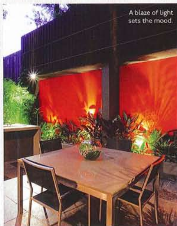
A blaze of light sets the mood.