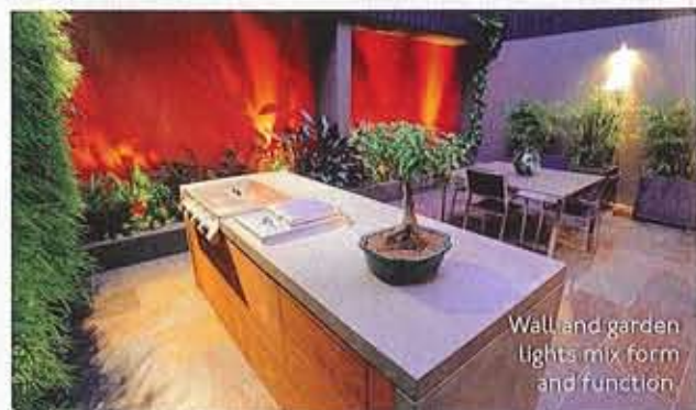
Wall and garden lights mix form and function.