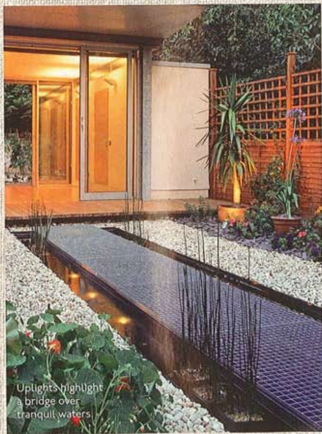
Uplights highlight a bridge over tranquil waters.