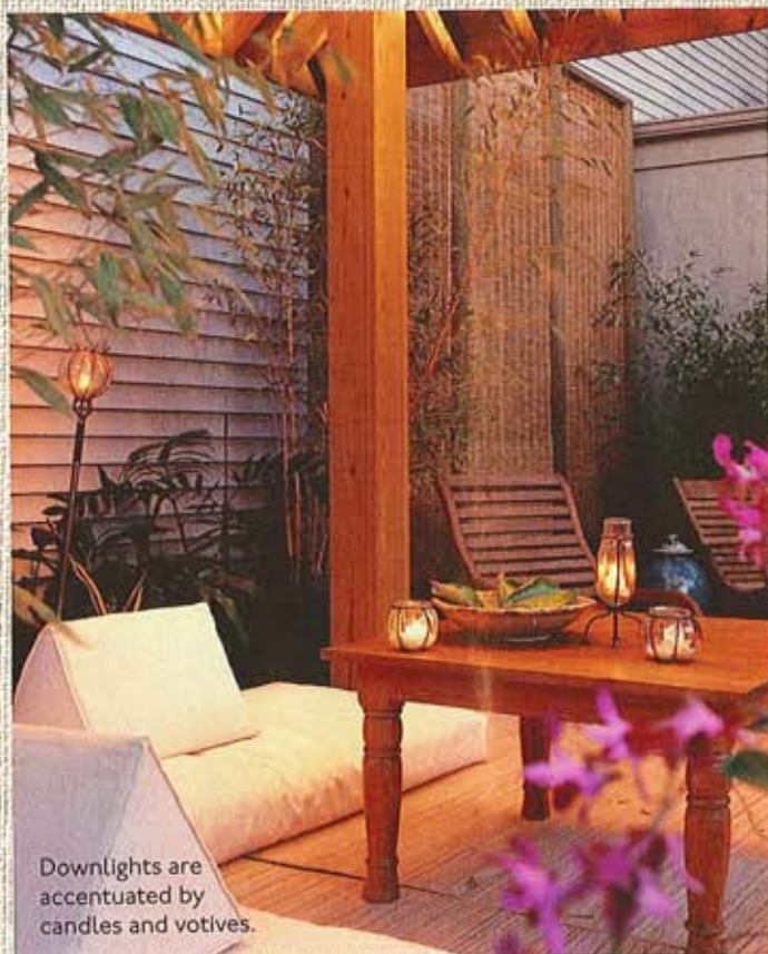
Downlights are accentuated by candles and votives.