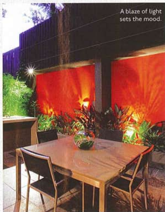
A blaze of light sets the mood.