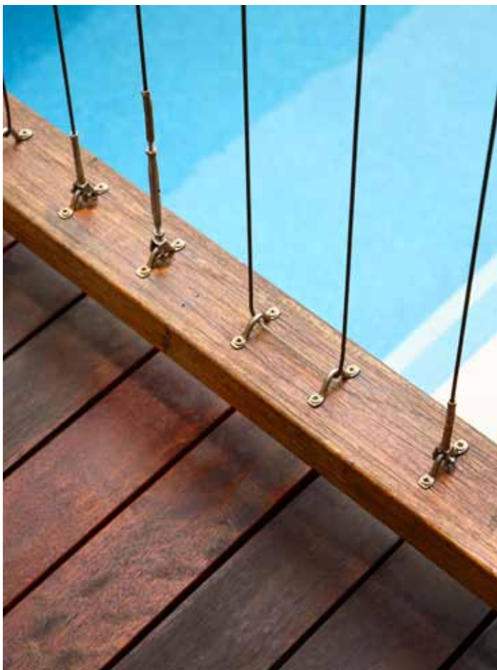
Deep green foliage and a sparkling blue pool bring this secret garden to vivid life

Light the way The garden is designed to be enjoyed at night, too. Lights in the garden bed cast flame-like patterns up the fence, and the pool is illuminated under the surface of the water. Matt installed downlights in the ceiling of the patio for after-dark entertaining, while lights in the stairs guide guests safely.