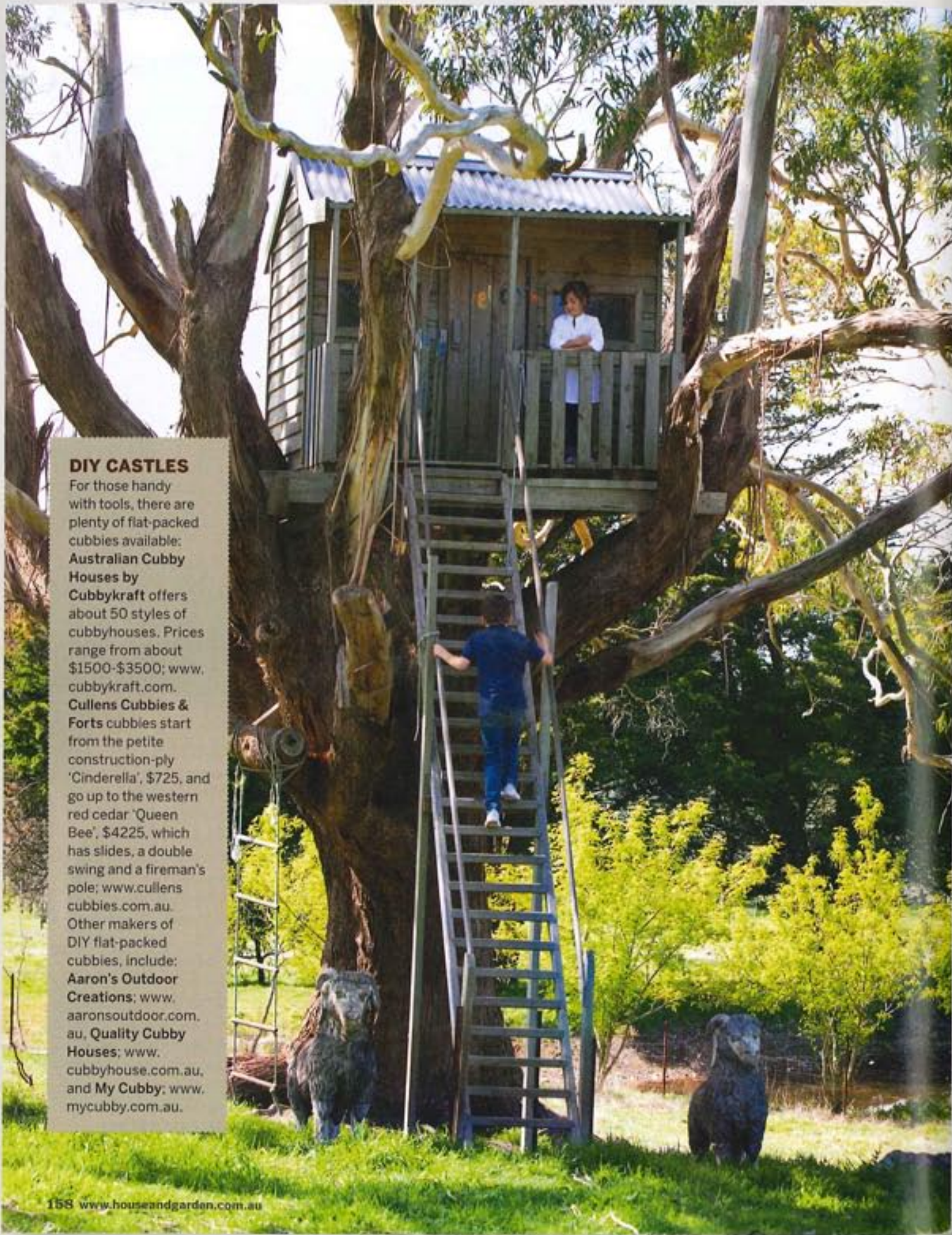
For Where to Buy, see page 190.