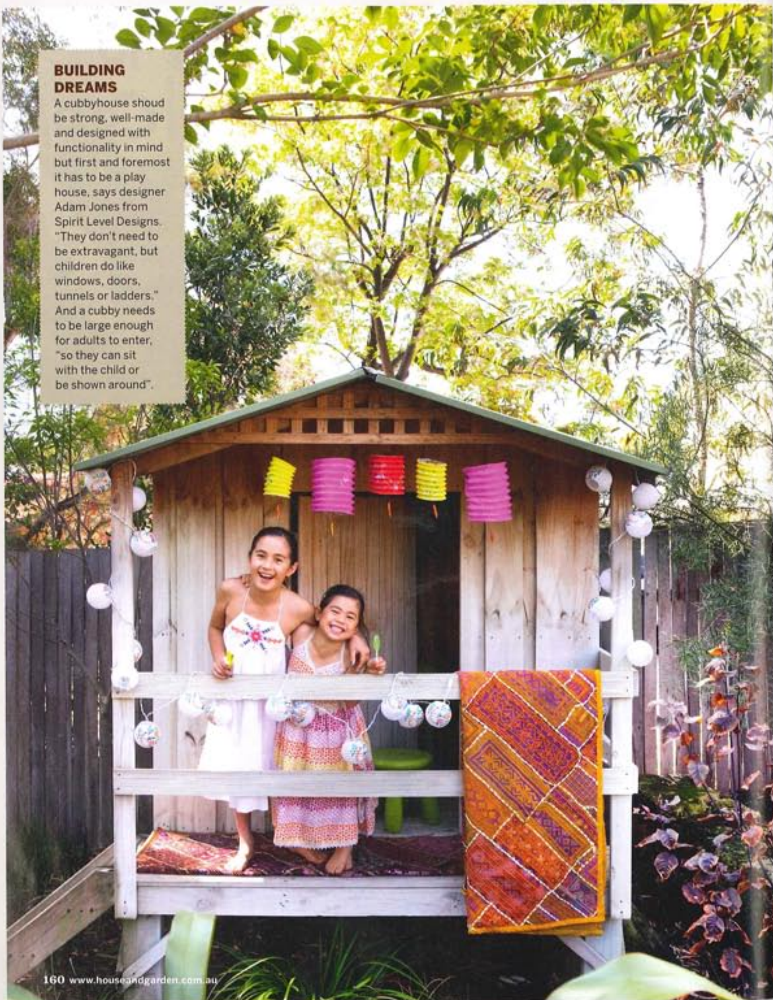
For Where to Buy, see page 190.