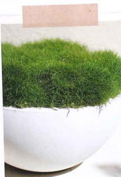
61. Choose pots that complement tiles and pavers. This pot ($624) from Quatro Design, planted with zoysia tenuifolia, is made of matt white ceramic.