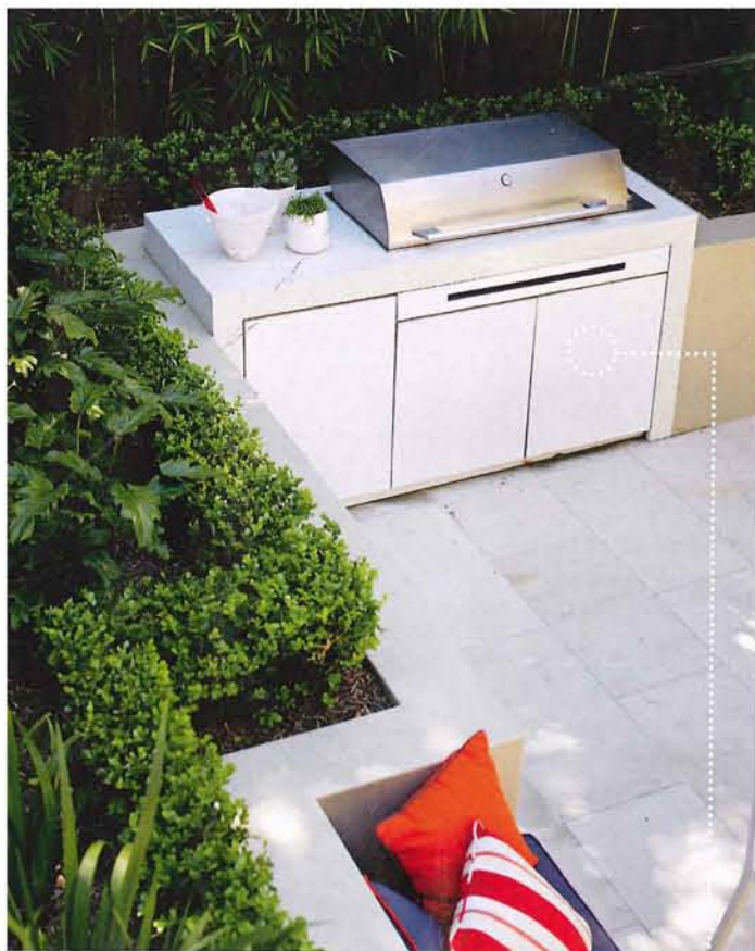
58. Splurge where it counts. The outdoor kitchen features cabinetry built from Alucobond with a Quarella benchtop and Electrolux barbecue. The family spends so much time eating outdoors, the cost is worth it for effect, convenience and durability.