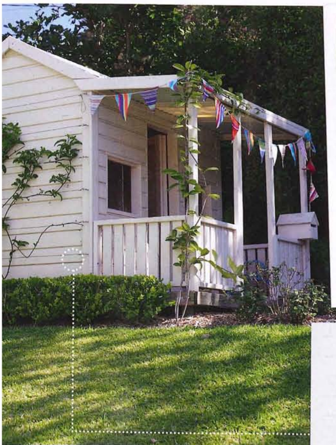
62. Separate your zones. The family's two kids love to play around the cubby house and sunny lawn, and can be easily seen from the pool area.