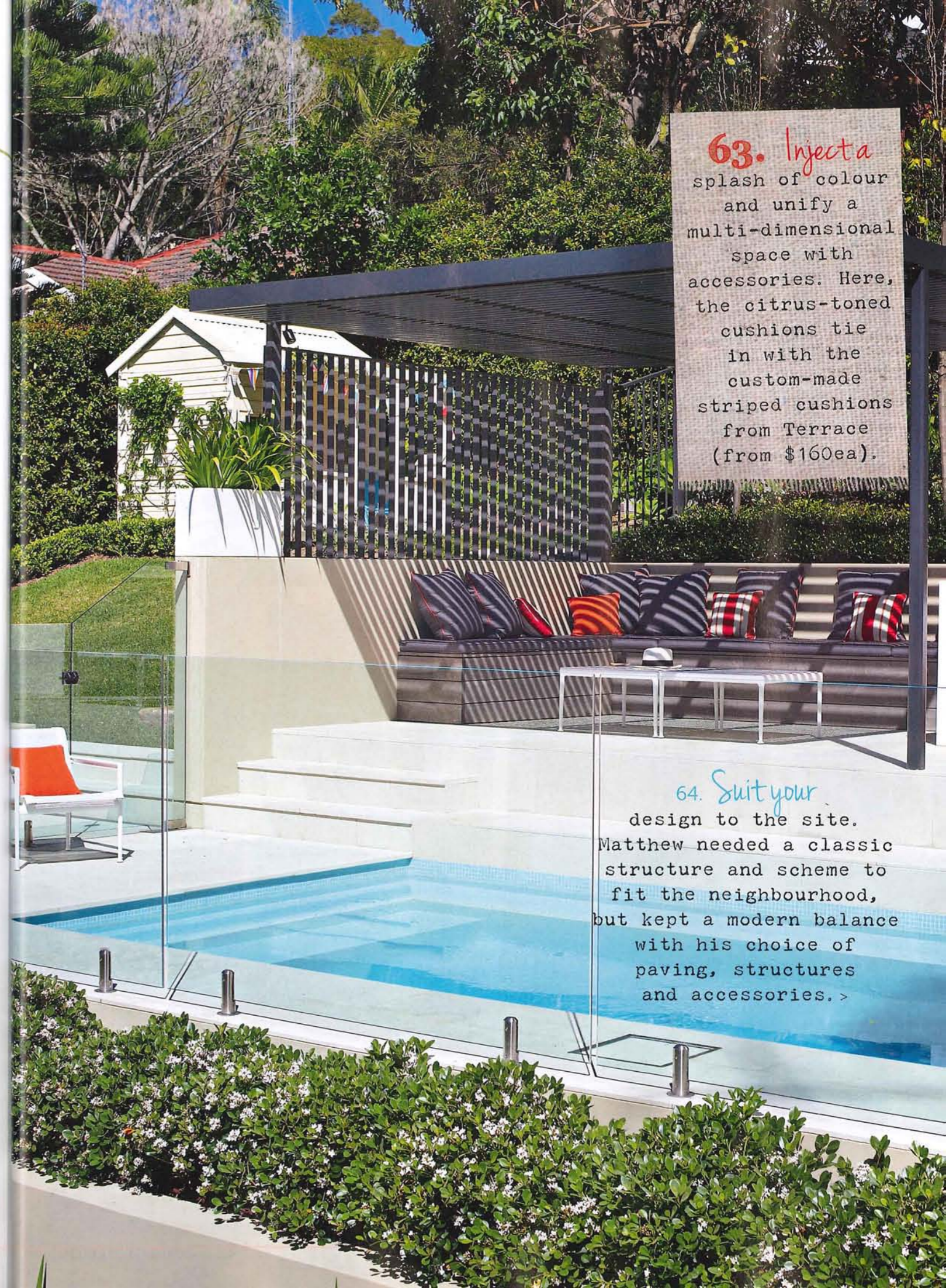
63. Inject a splash of colour and unify a multi-dimensional space with accessories. Here, the citrus-toned cushions tie in with the custom-made striped cushions from Terrace (from $160ea).