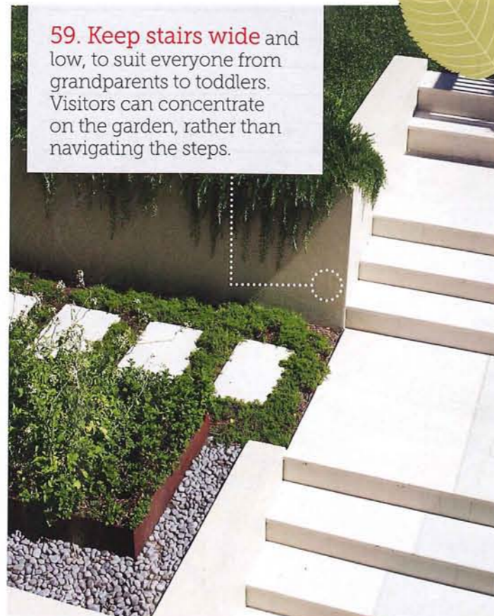
59. Keep stairs wide and low, to suit everyone from grandparents to toddlers. Visitors can concentrate on the garden, rather than navigating the steps.