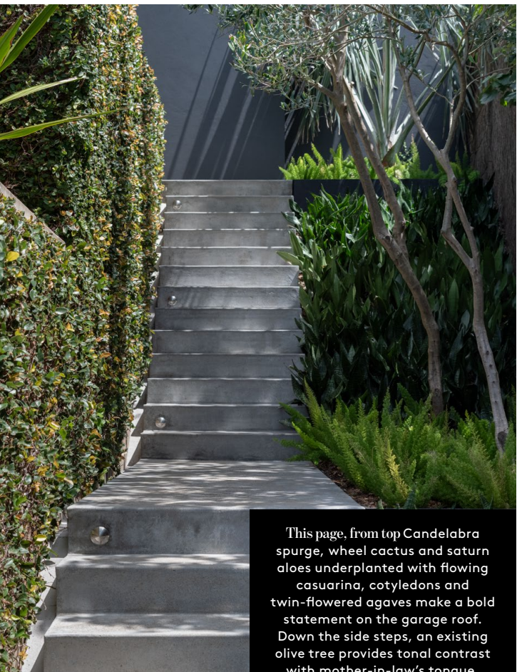
This page, from top Candelabra spurge, wheel cactus and saturn aloes underplanted with flowing casuarina, cotyledons and twin-flowered agaves make a bold statement on the garage roof. Down the side steps, an existing olive tree provides tonal contrast with mother-in-law's tongue, asparagus ferns and creeping figs.