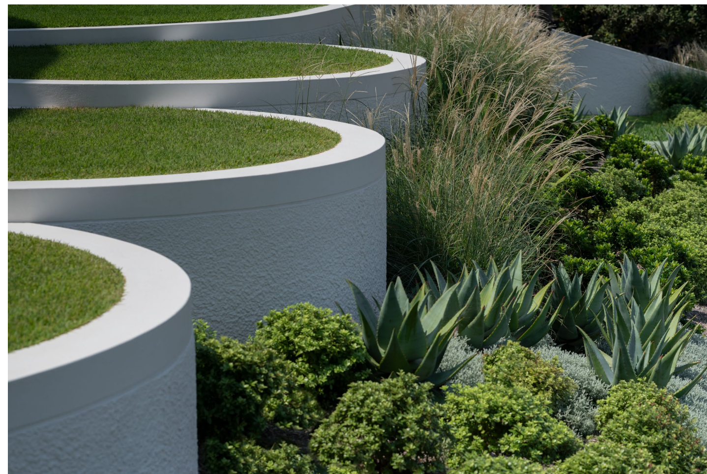
As you move to the rear of the property, large circular grass landings adjoin a circular fire pit.